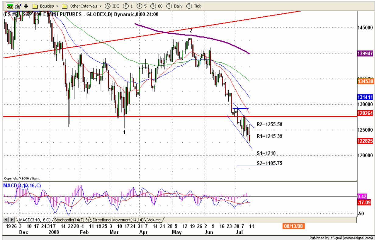
ESU8 Daily Chart

After sharp bounce overnight, ES couldn't hold its gain; instead it gave it all back in the end. It indicates that another leg down move is ycoming. In the Bear market, the more "failed rally" attempts, the greater the likelihood for a wash-out plunge in prices prior to a low. As long as ES doesn't move above 1261.75, the trend remains bearish and 1200-1185 range could be the destination for the next leg.