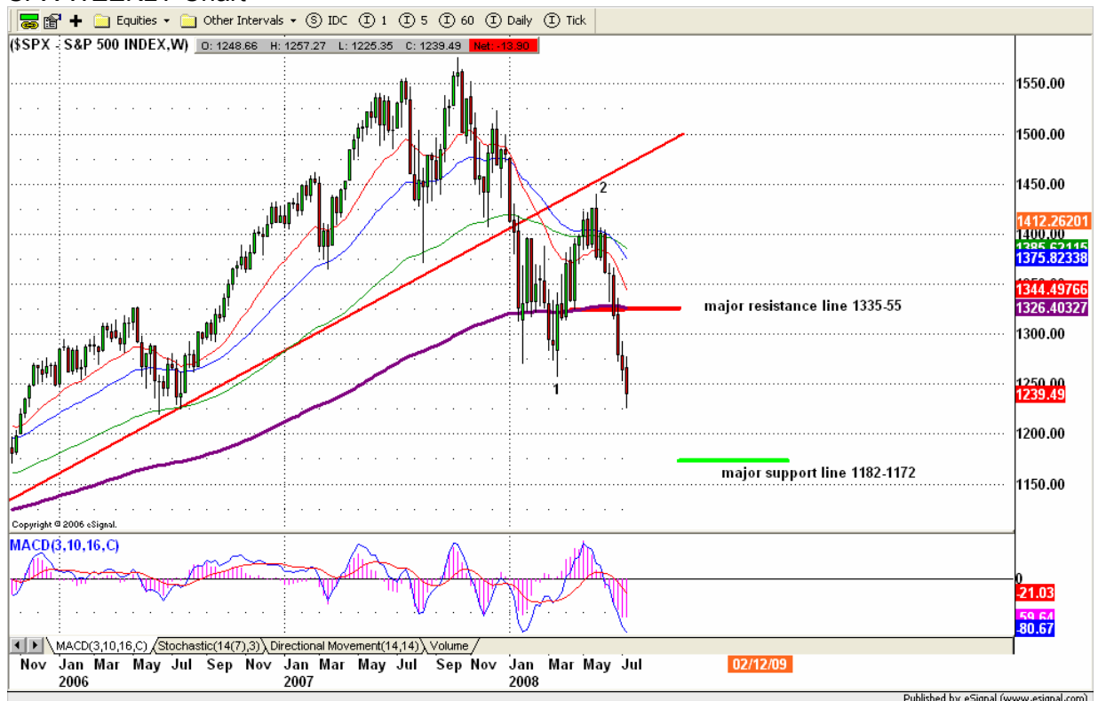
SPX WEEKLY Chart

Major monthly resistance level is 1335 and major support level is 1175 Major weekly resistance level is 1278 and support level 1175.00