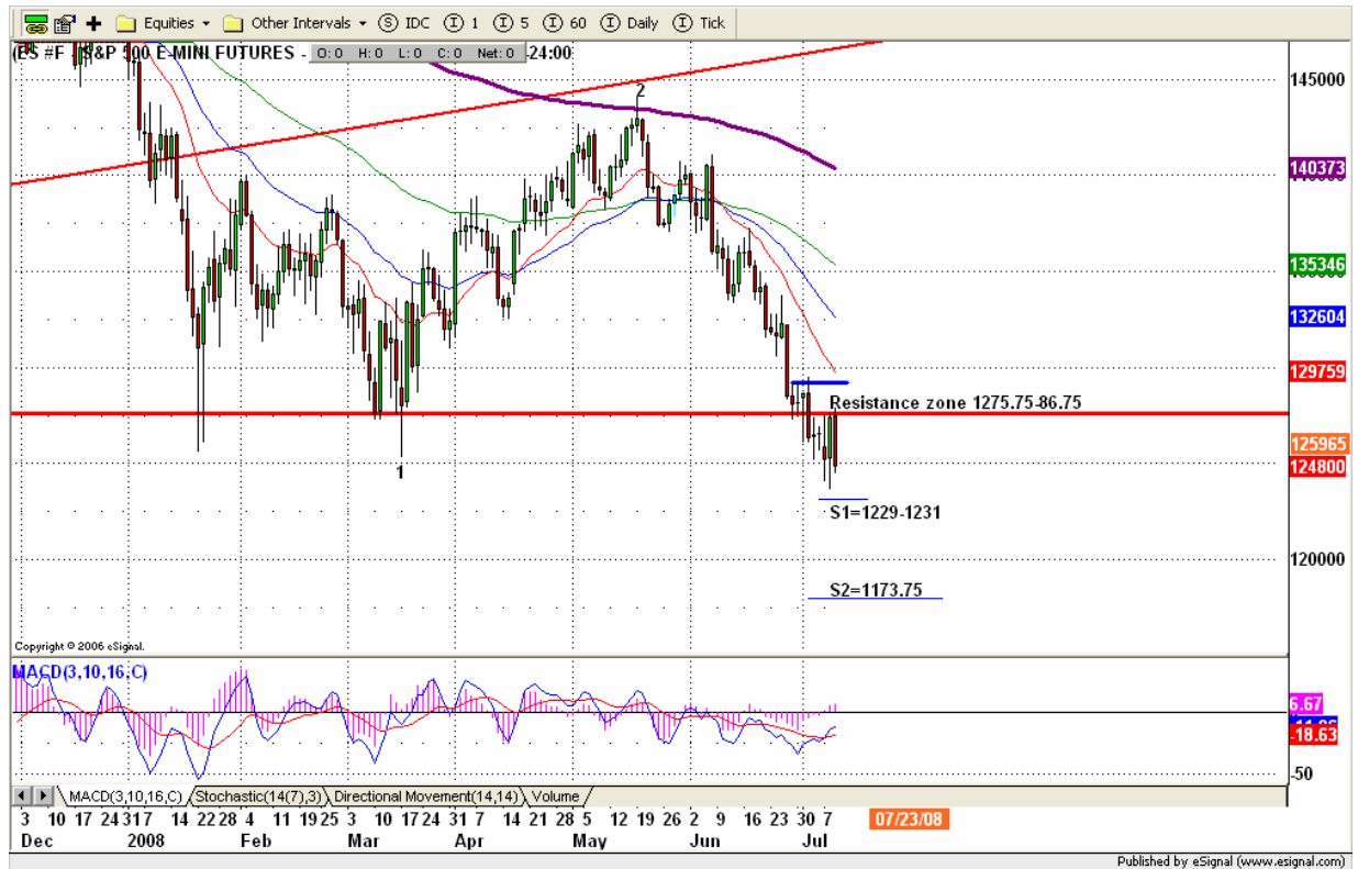
ESU8 Daily Chart

ES pulled back into Monday's low area yesterday. It indicates the wave 1 of big wave 3, which moved down from May 19 high hasn't completed yet. It suggests that more selling pressure and lower price ahead of Monday's low. And the trend remains bearish.