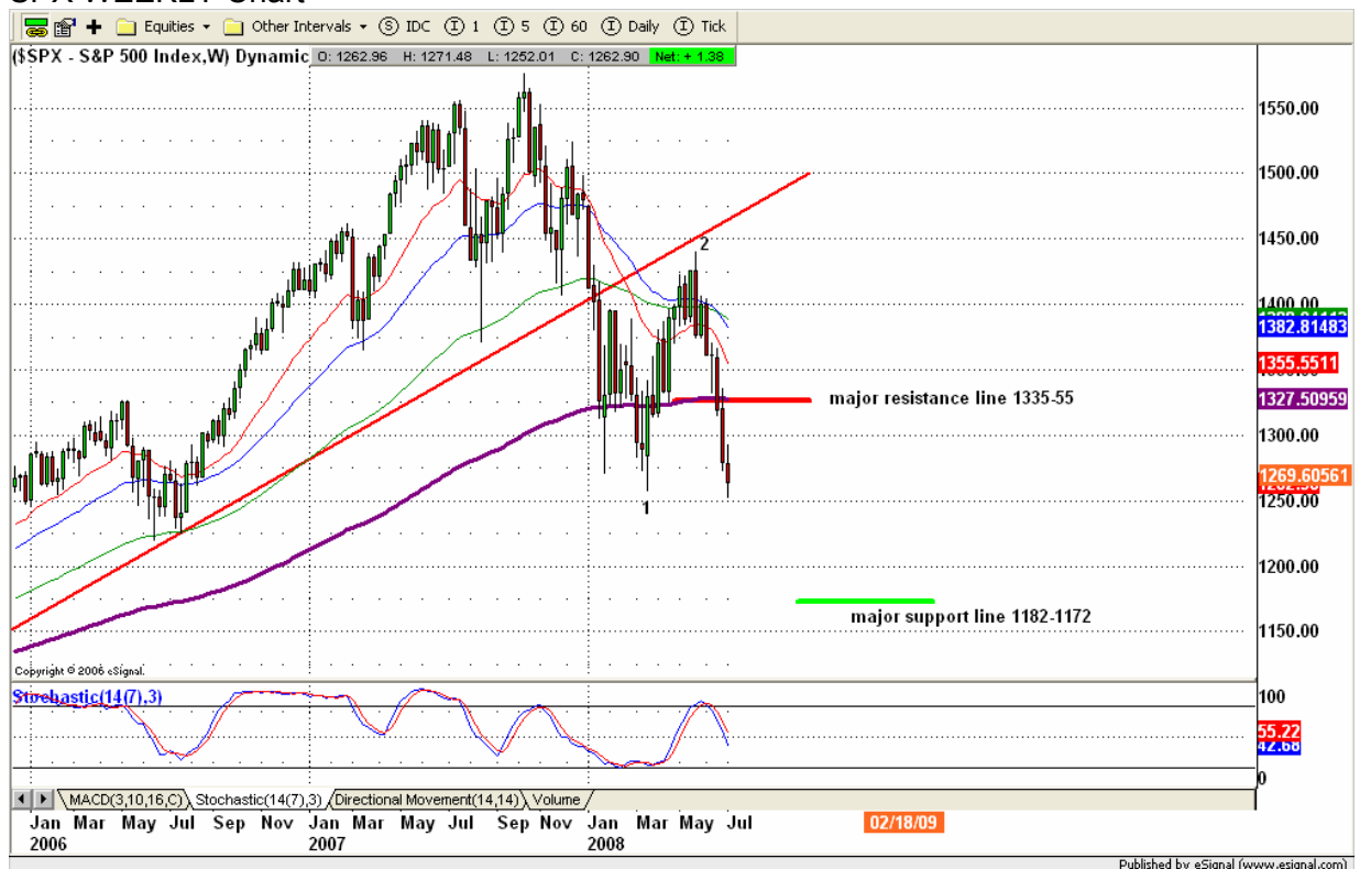
SPX WEEKLY Chart

Major monthly resistance level is 1335 and major support level is 1175 Major weekly resistance level is 1306 and support level 1207.