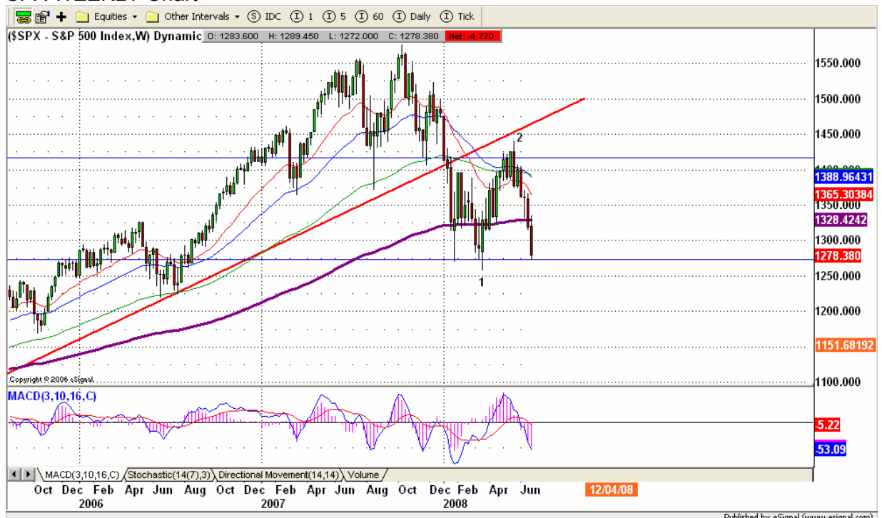
SPX WEEKLY Chart

Major weekly resistance level is 1318.00 and support level 1220.