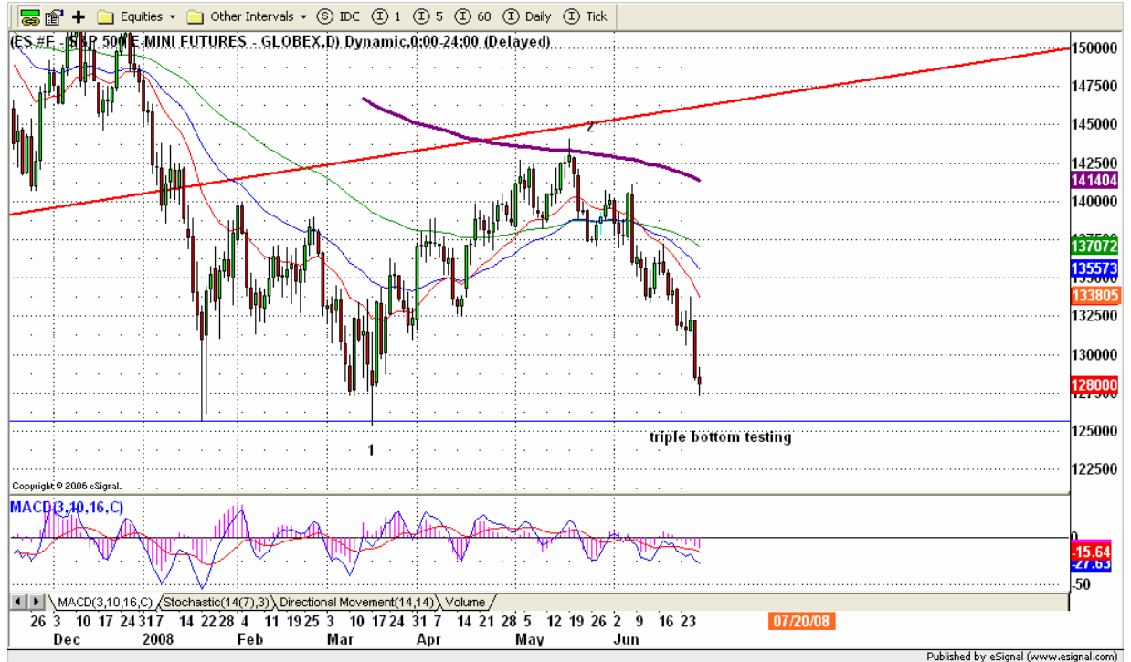
ESU8 DAILY Chart

Last Friday ES made its continuation low move. Today we may see ES holding up last Friday's low, but we may also see a breakdown last Friday's low first to make a new low before ES bounces back up again. Because today is last day of June, some funds may be selling some of their holdings. Also last Friday, $VIX didn't hit a panic bottom. It indicates there still is some selling pressure in this market even though it has a deeply oversold condition in the short term.