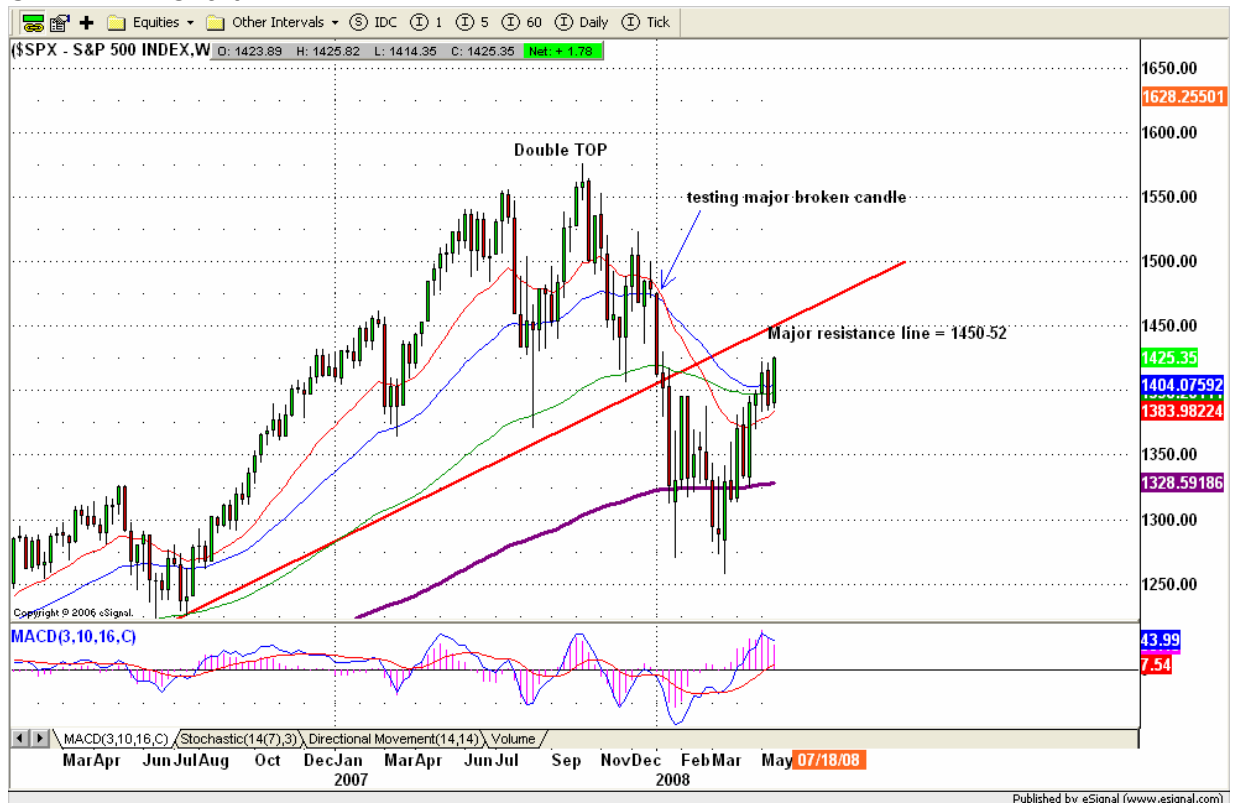
SPX DAILY Chart

Major monthly resistance level 1485 and support level 1350. Major weekly resistance level is 1465 and support level 1385.