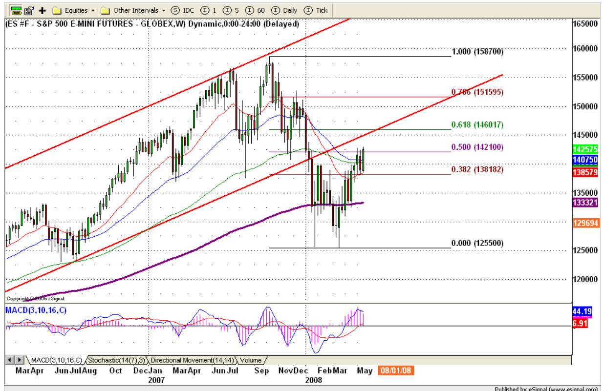
ES WEEKLY Chart

Weekly major resistance level is 1470, Weekly major support is 1380