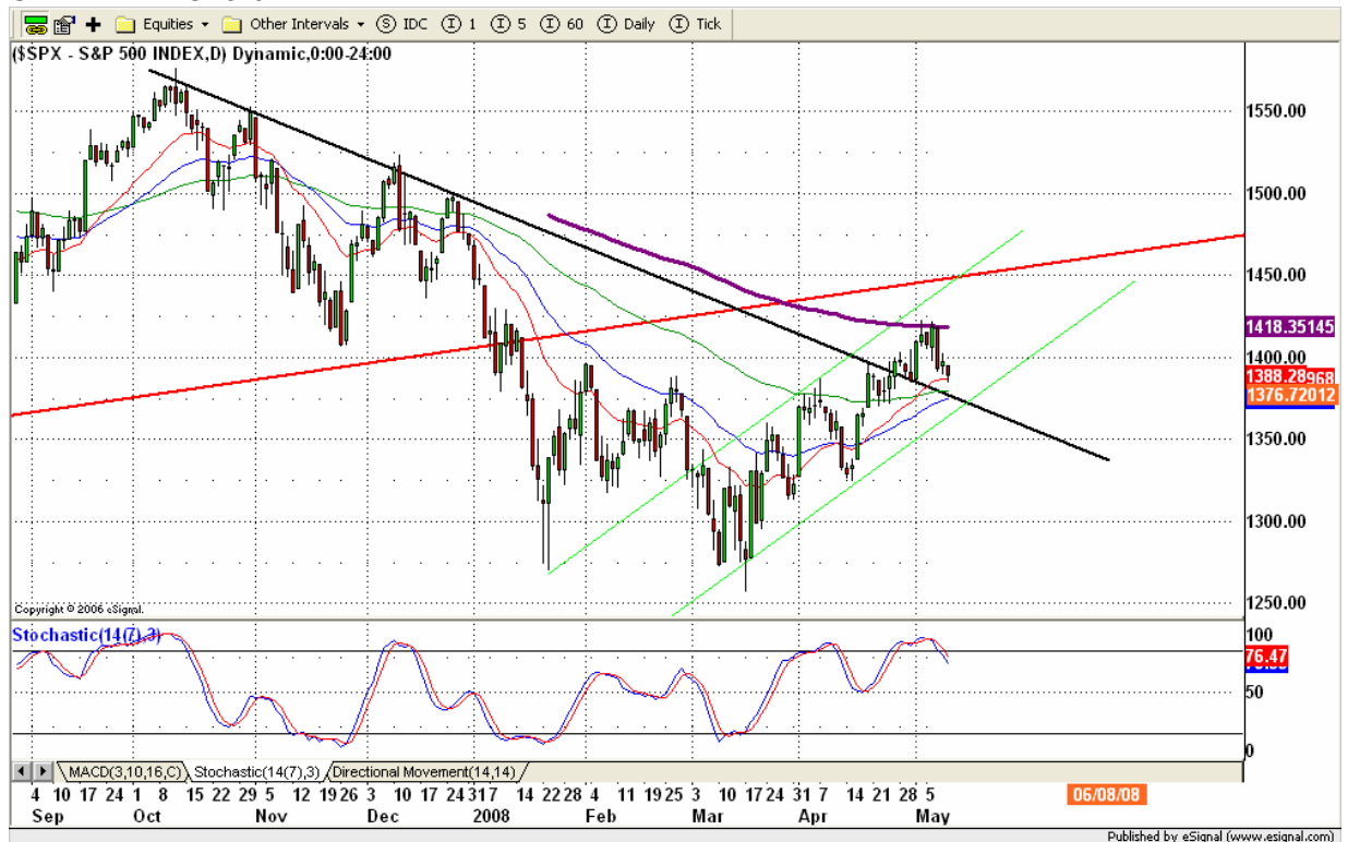
SPX DAILY Chart

Major monthly resistance level 1485 and support level 1350. Major weekly resistance level is 1425 and support level 1350.