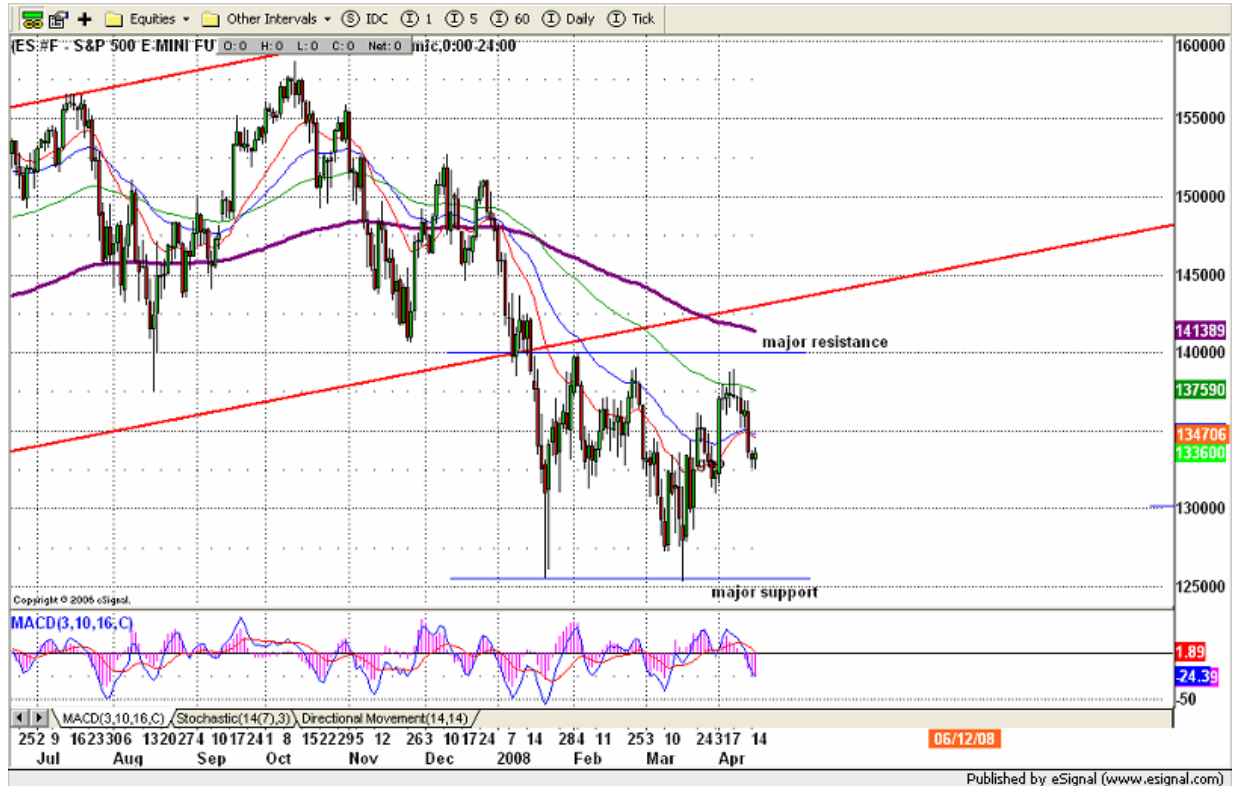
ESM8 Daily Chart

Earning report season, plus option expiration make a choppy movement for our market. After yesterday's close, Intel report and outlook for next quarter busted out in overnight market trading and made ES pop up to its major resistance level. Today early morning CPI and housing sale report are key. It could send ES back down to 1325-24 area if economic report is not so good.