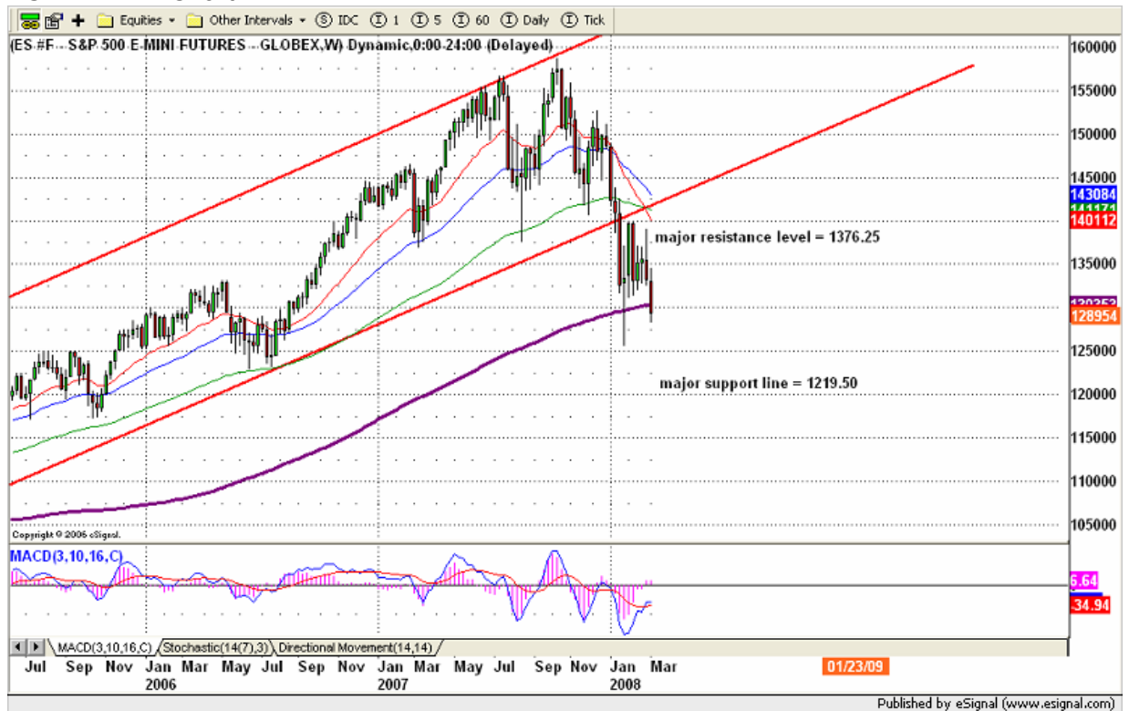
ES WEEKLY Chart

Weekly major resistance level is 1345. Weekly major support is 1255-40