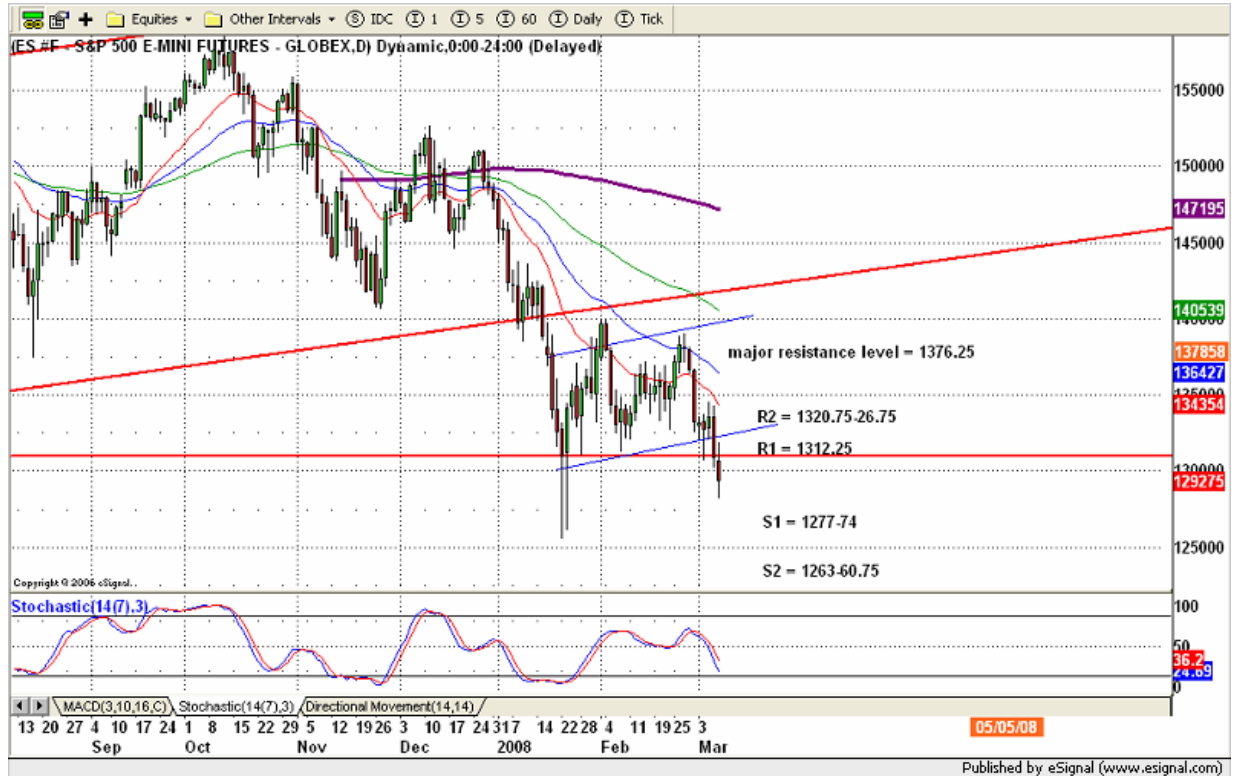
ESH8 DAILY Chart

We may see ES bounces up to retest last Friday's high if it can hold the price above 1287-86 level overnight. But as long as ES holds price below 1320.50-26.75 range, the downtrend remains intact, and we should expect to retest last Friday's low.