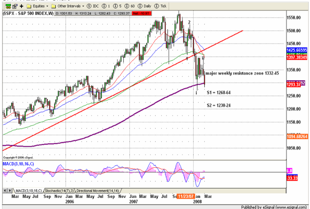
SPX WEEKLY Chart

Monthly major resistance level 1375 and major support level 1219 Major weekly resistance level is 1335 and support level 1245