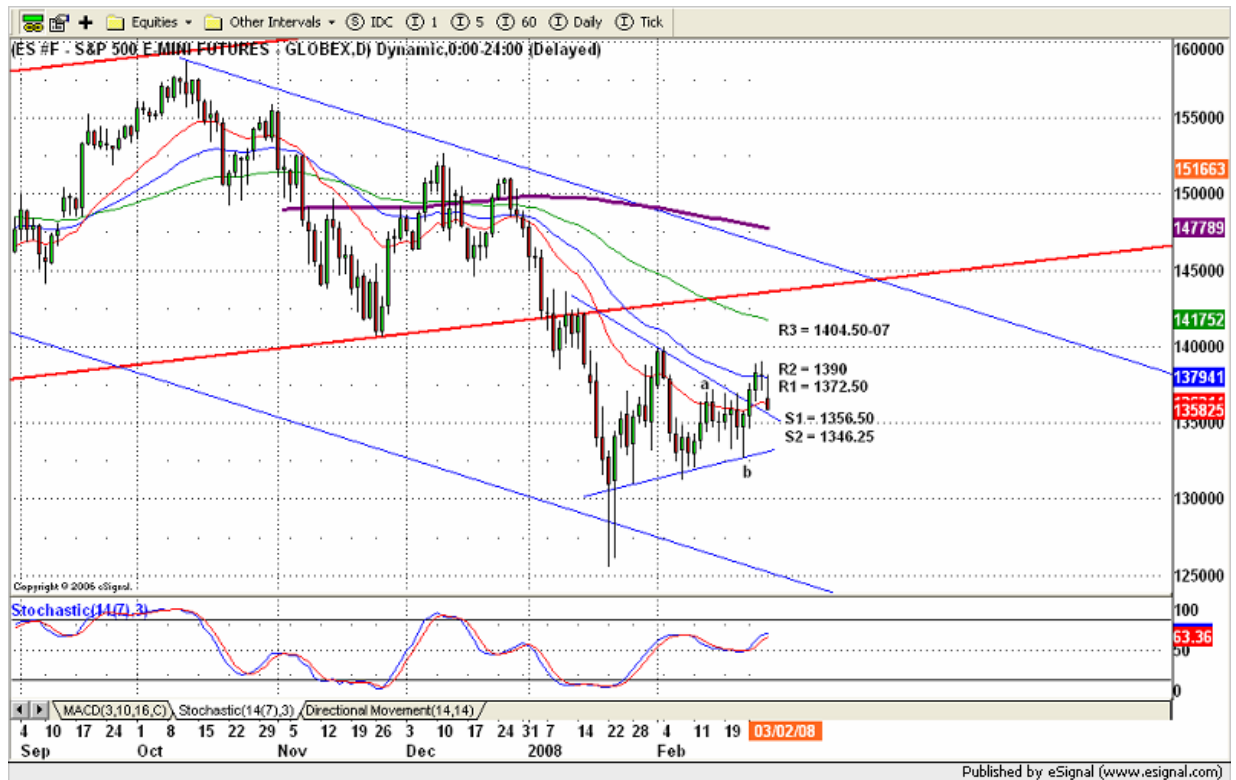
ESH8 Daily Chart

ES pulled back into its breakout triangle pattern resistance line, which currently acts a support. Today is last day of February. If ES closes below 1346 level, it indicates short-term counter move is complete.