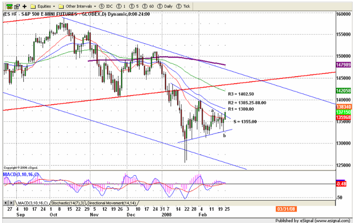
ESH8 Daily Chart

Yesterday's breakout move disrupted the triangle wave structure. As long as 1364-60 range holds ES up, the price could be pushed up to 1380 which is close to the 40 day moving average line. It could also move higher to complete a small a-b-c pattern around 1385.25-88.00 or a big A-B-C pattern around 1402.50. How high the ES goes, depends largely on the economic reports released today, tomorrow and Thursday (see Section 9 below).