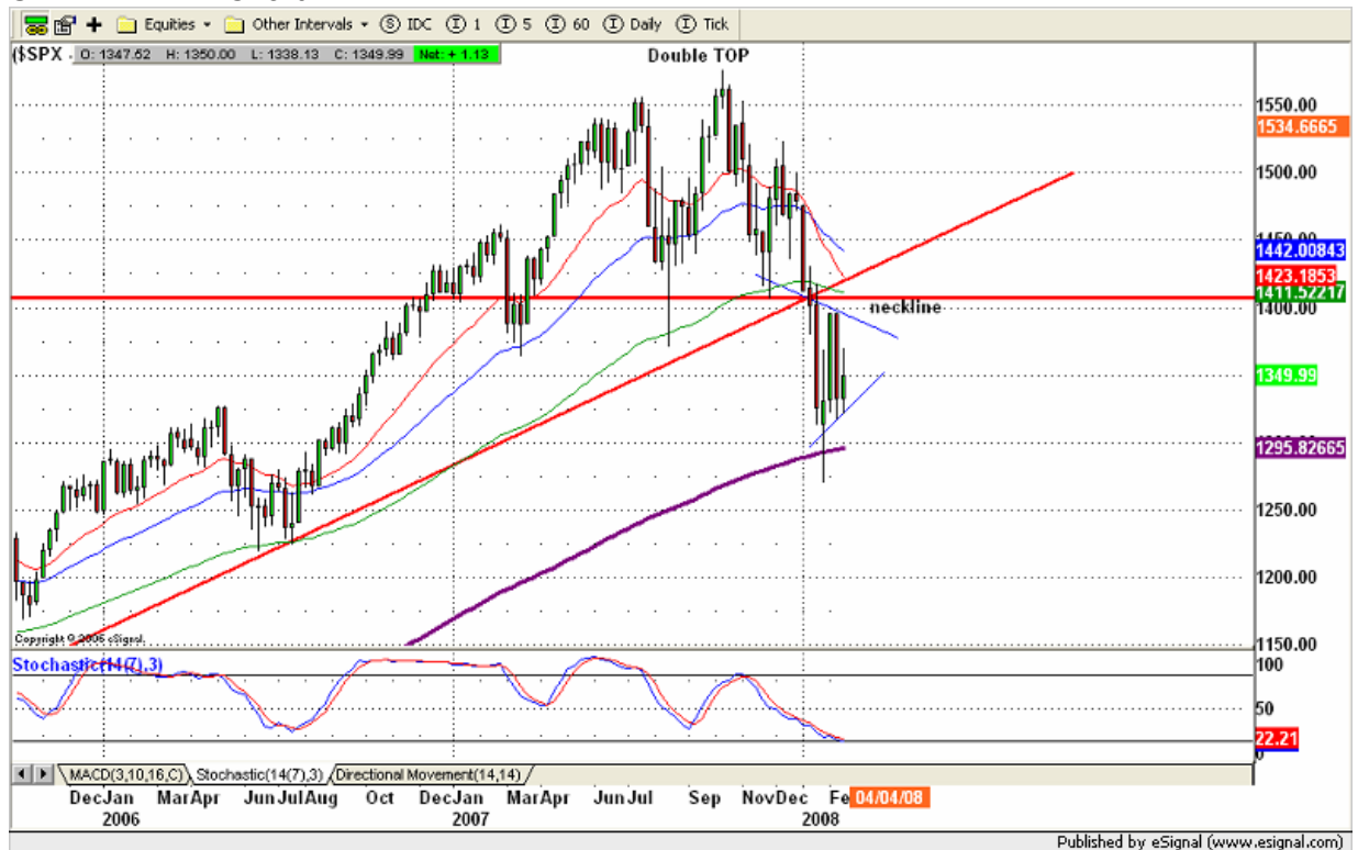
SPX WEEKLY Chart

Monthly major resistance level 1435 and major support level 1255 Major weekly resistance level is 1411.50 and support level 1295.50