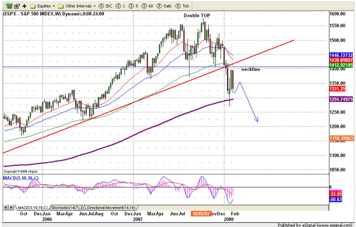
SPX WEEKLY Chart

Monthly major resistance level 1435 and major support level 1255 Major weekly resistance level is 1365 and support level 1255