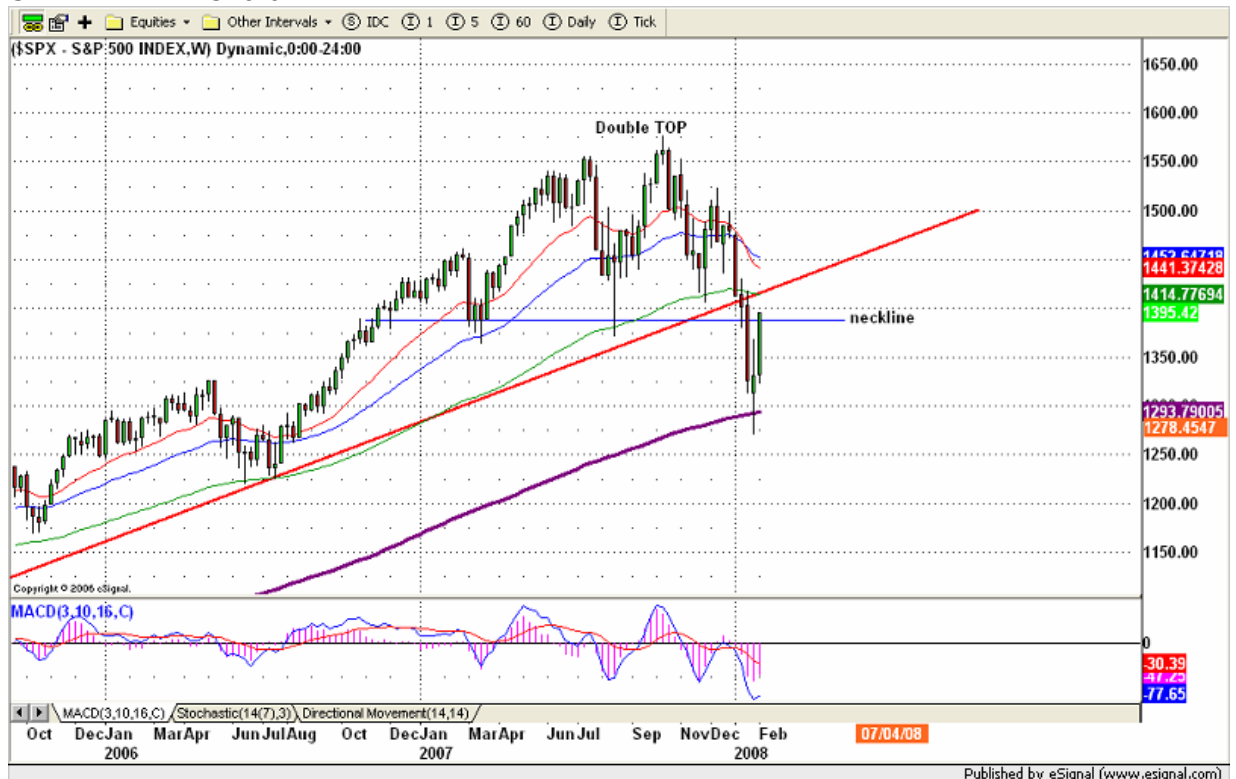
SPX WEEKLY Chart

Monthly major resistance level 1435 and major support level 1255 Major weekly resistance level is 1435 and support level 1335