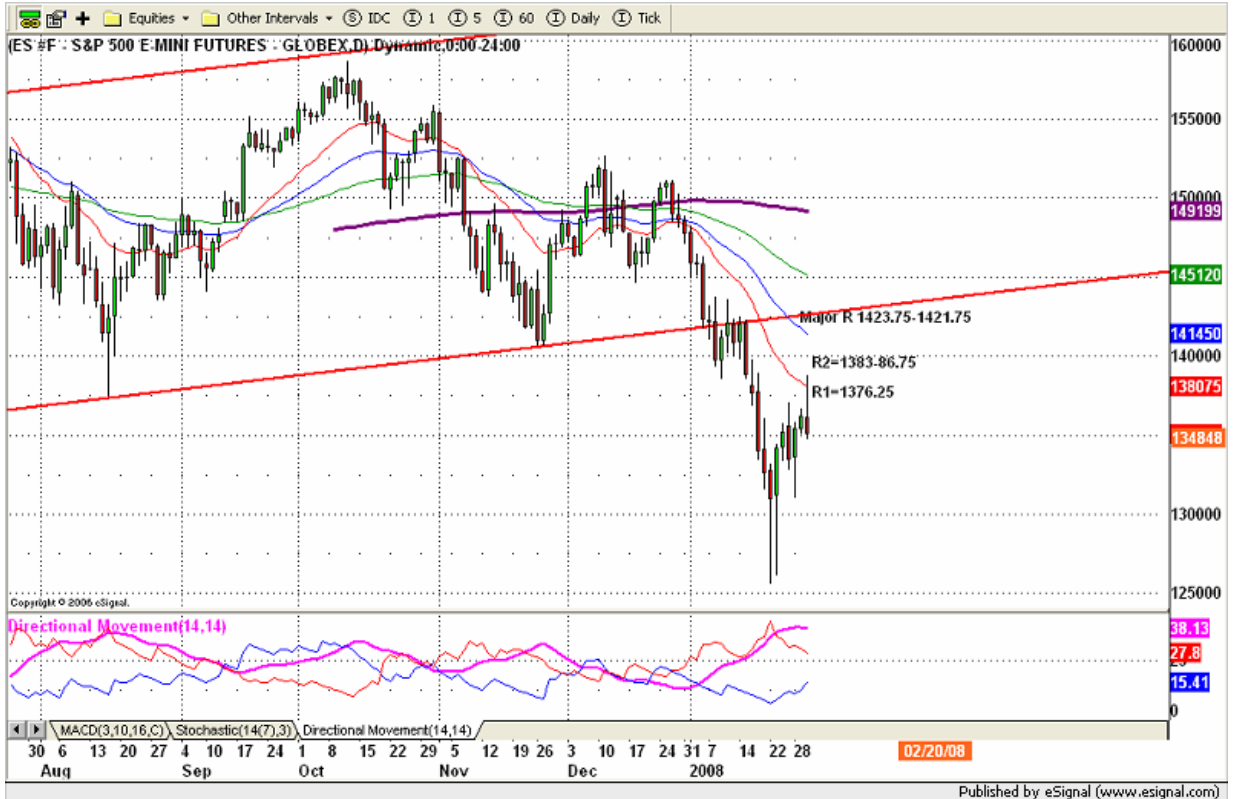
ESH8 Daily Chart

After Fed announcement, ES broke out from yesterday's trading range to shakeout shorts first. As soon as it completed its breakout pattern move, it turned around into yesterday's trading range and started to shakeout the buyers. Today we should see range breakdown continuation move first before ES moves back up to retest 1350-51.25 range. As long as 1351.75 level holds ES down, the current trend remains downside and bearish.