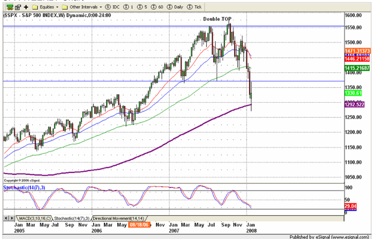
SPX WEEKLY Chart

Monthly major resistance level 1375 and major support level 1208 Major weekly resistance level is 1375 and support level 1250