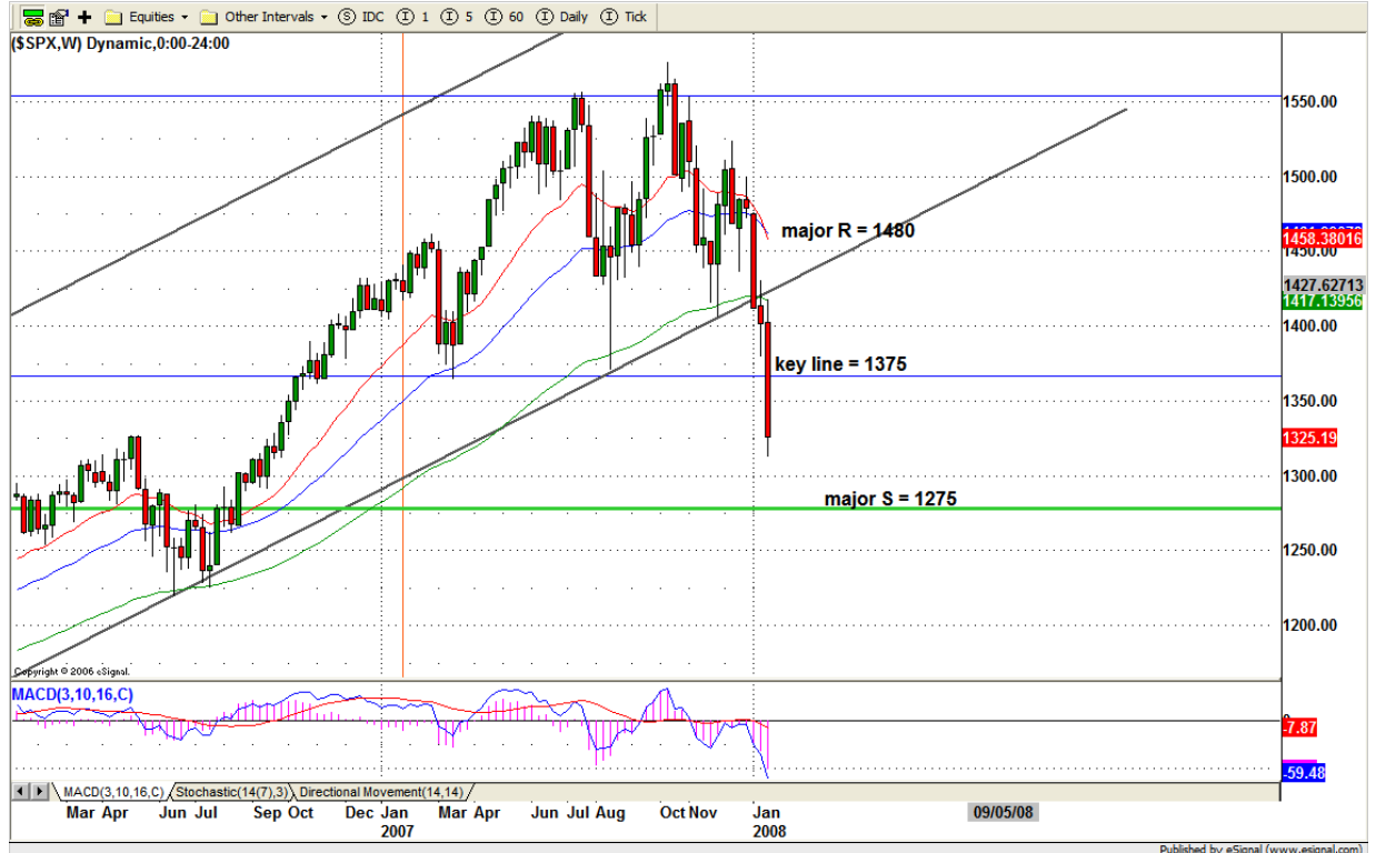
SPX WEEKLY Chart

Monthly major resistance level 1375 and major support level 1208 Major weekly resistance level is 1375 and support level 1208