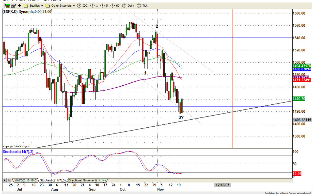
SPX DAILY Chart

Major monthly resistance level for SPX is 1540 and support level is 1318 Major weekly resistance level for SPX is 1494 and support level 1415