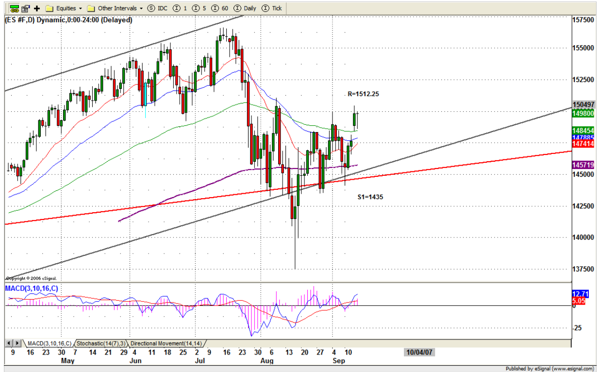
ESZ7 DAILY Chart

Last Friday ES closed above its 89 day moving average on relatively low volume. Today we may see ES to go up to retest last weekly high 1504-06 area, and then move back down to test 1491-92 level. As long as 1491-92 range can hold price up, more likely to see ES goes within 1506-1491 range to wait for Tuesday's afternoon FED announcement. If ES fails to hold up 1484 level, it is likely for ES to go down to 1471.75-67.50 range for testing.