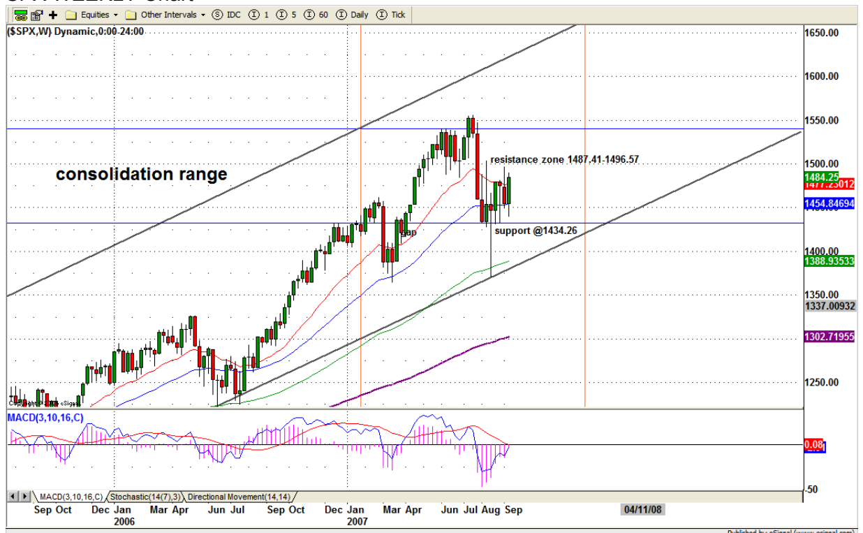
SPX WEEKLY Chart

Major monthly resistance level for SPX is 1545 and support level is 1356 Major weekly resistance level for SPX is 1504 and support level is 1425