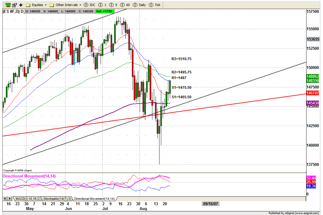
ESU7 DAILY Chart

It is possible to see ES to move higher to 1493-95 level if it breaks out of the 1487 level. In the meanwhile, 1463.25 is key for controlling downside move. Failure to hold price above 1463.25 could trigger selling momentum, and push price back down to 1447 or lower to 1434.50