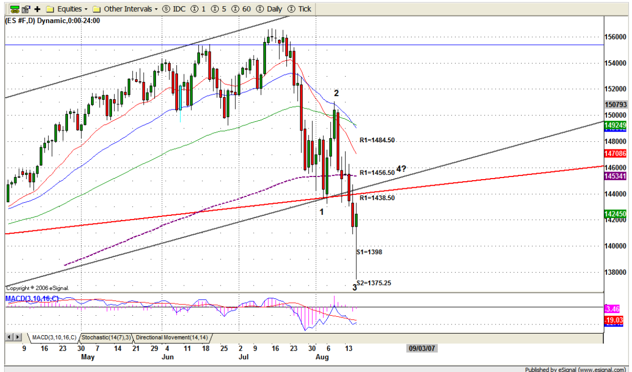
ESU7 DAILY Chart

Yesterday's rally has two reasons. One is that market is in extremely oversold condition, Second is one bearish pattern completion level overlap yearly low area. Whether this rally is true one or not, depends on today's follow through. Because today is option expiration day, yesterday's rally could be related to today's expiration. In other words, it may be a faking rally.