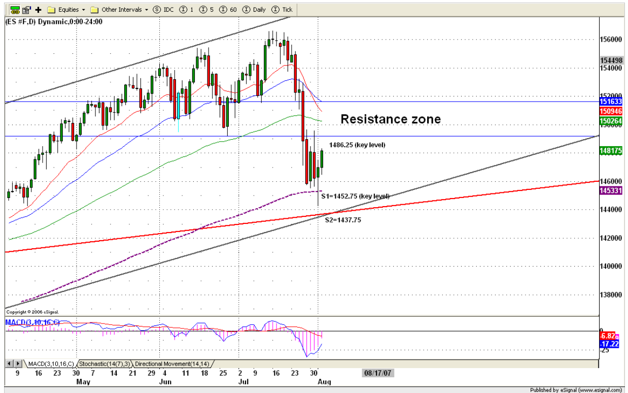
ESU7 DAILY Chart

How far this rally will take, it depends on how sharp the shorts covering and how strong the market sentiment shifts. Basically we should see 0.618% Fibonacci retracement from the first major low (1445-1442.50 range). So maximum 1520-1518 range could be seen from this counter move within next several weeks.