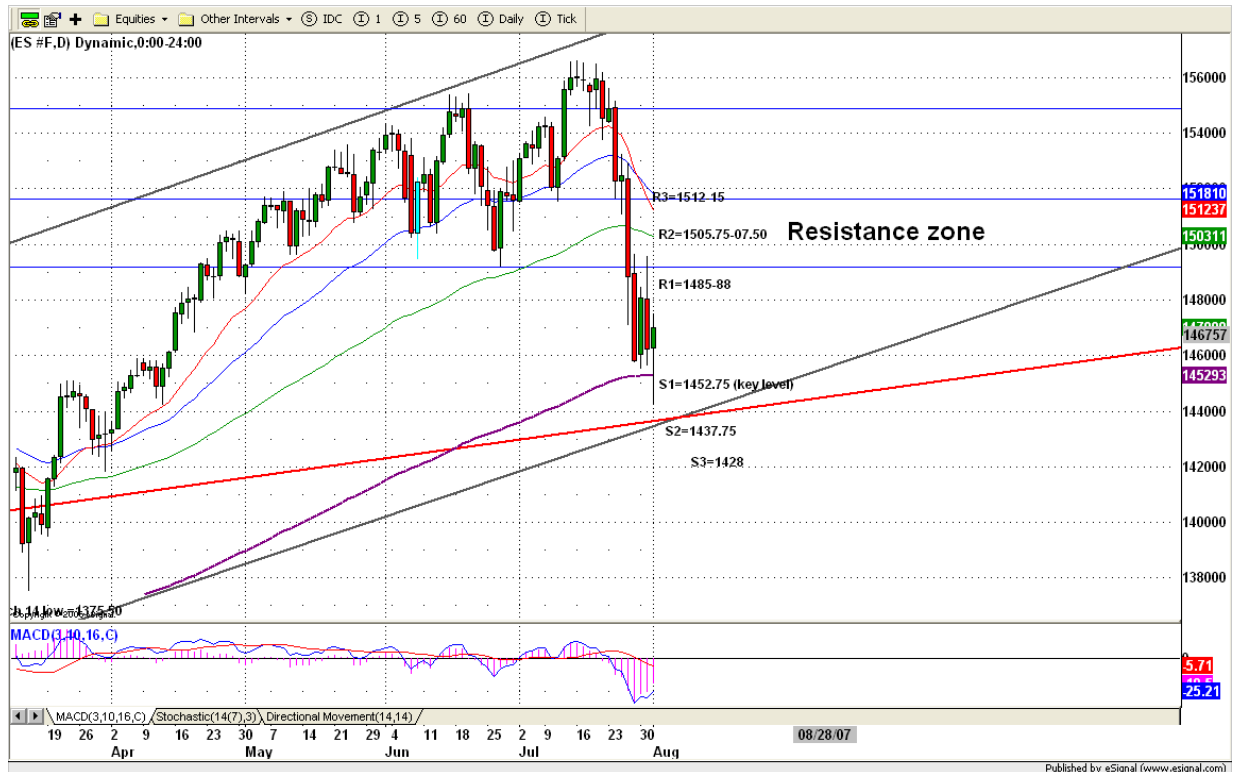
ESU7 DAILY Chart

ES holds up its long term support line (200 ema line) for four days now. If today it can successfully hold the price up, then a decent bounce up to 1505-1515 level should be expected today or tomorrow.