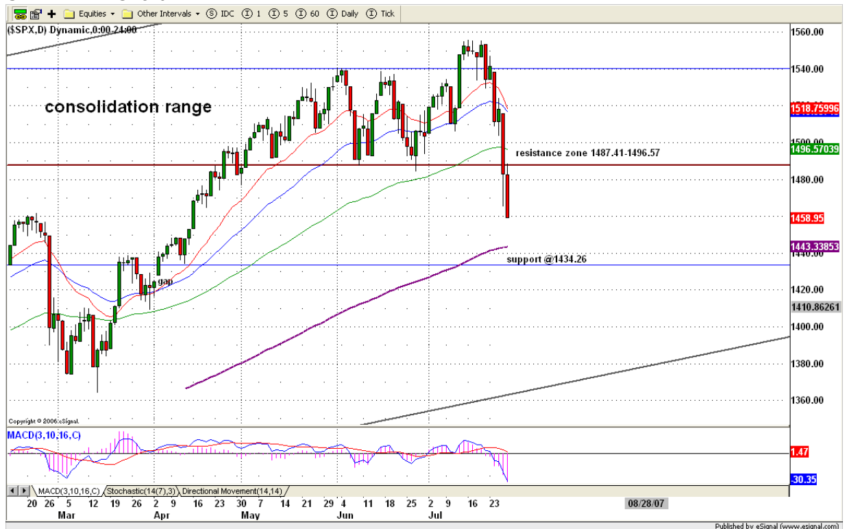
SPX DAILY Chart

Major weekly resistance level for SPX is 1496.50 and support level is 1430.00