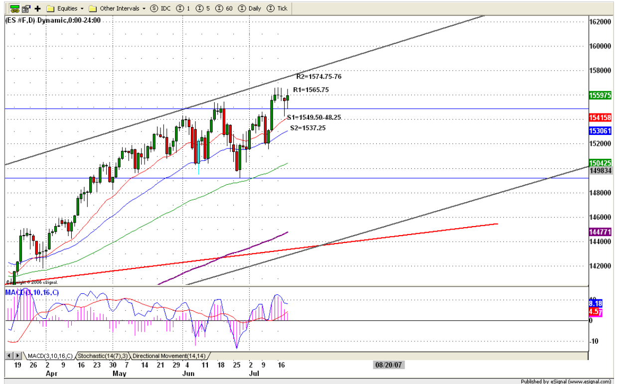
ESU7 DAILY Chart

Typical option game movement again yesterday. ES sharply gaped up and later lost its upside momentum. Even it closed higher than the previous day, it lost 2pts from its opening price. Today we may see ES repeat its move until option expiration day is over.