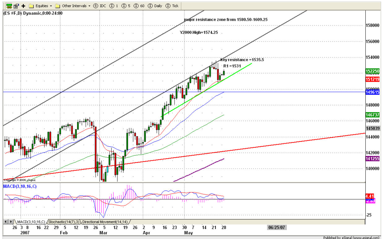
ESM7 DAILY Chart

All three major markets were cheered by a good consumer confidence report yesterday. So was ES. It bounced from its 20 daily moving average line and closed at high range. Based on Daily chart, it is likely for ES to move higher to test 1529-31 range if 1520-18 level holds price up.